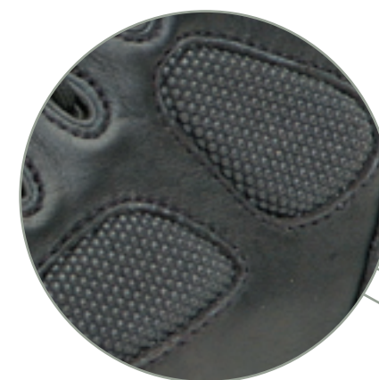
Super Fabric ® Panels