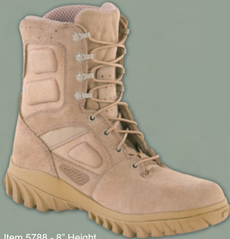
Item 5788 - 8" Height Made in USA Berry Amendment Compliant

The Desert Hoplite ® Series was developed as core equipment for the modern day hoplite; the American warrior. Built from the ground up, these combat boots are designed to exceed the needs of the most well trained fighting force the world has ever known.