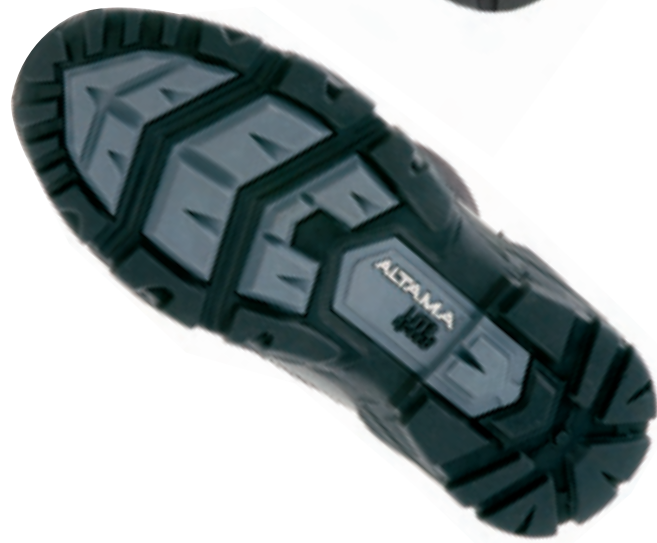
LITESpeed Tactical Lug