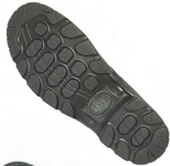
Flight Line Plus™