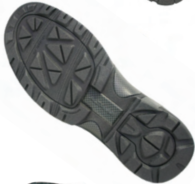
EXOSpeed Tactical Lug