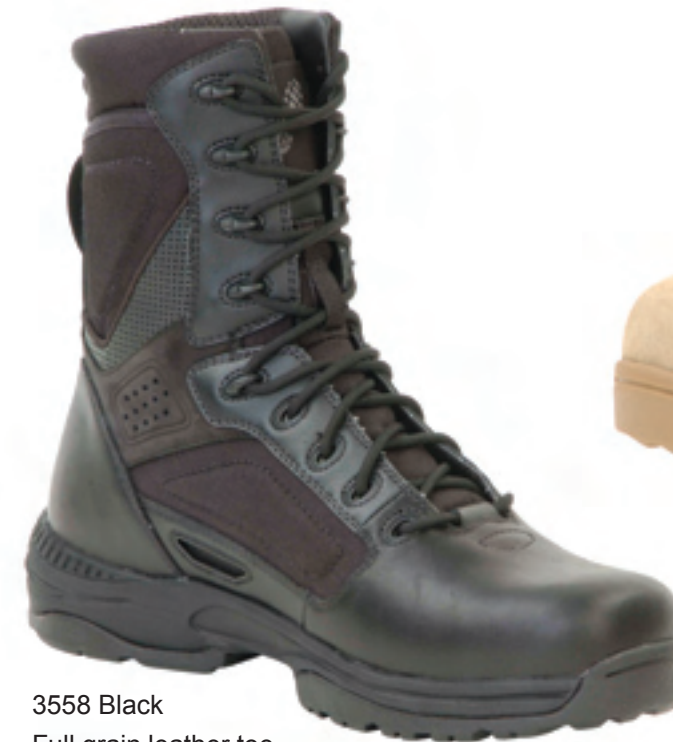
3558 Black Full grain leather toe is easy to polish