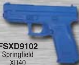
FSXD9102 Springfield XD40