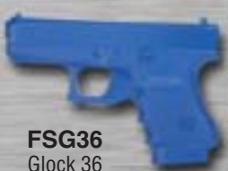
FSG36 Glock 36