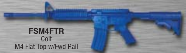
FSM4FTR Colt M4 Flat Top w/Fwd Rail