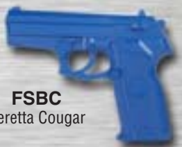
FSBC Beretta Cougar