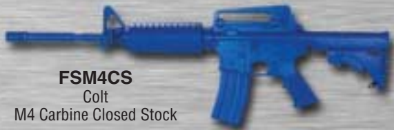
FSM4CS Colt M4 Carbine Closed Stock