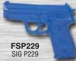
FSP229 SIG P229