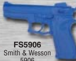
FS5906 Smith & Wesson 5906

Sigarms is the registered trademark of SIGARMS, Inc.