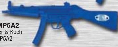
FSMP5A2 Heckler & Koch MP5A2