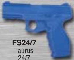
FS24/7 Taurus 24/7