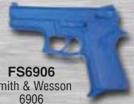
FS6906 Smith & Wesson 6906