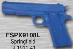
FSPX9108L Springfield GI 1911 A1