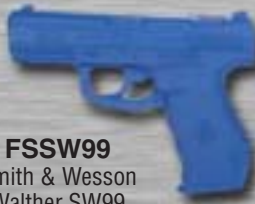
FSSW99 Smith & Wesson Walther SW99