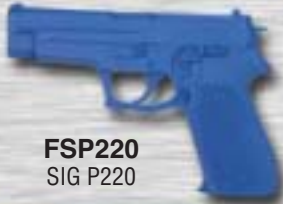
FSP220 SIG P220