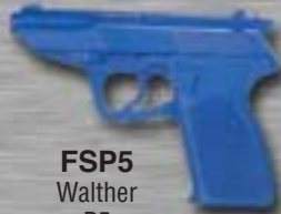
FSP5 Walther P5