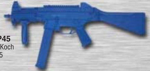
FSUMP45 Heckler & Koch UMP45