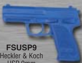
FSUSP9 Heckler & Koch USP 9mm