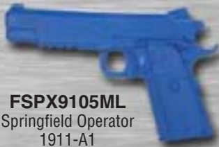
FSPX9105ML Springfield Operator 1911-A1