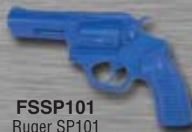
FSSP101 Ruger SP101