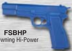
FSBHP Browning Hi-Power

Beretta is the registered trademark of Beretta USA Corp.