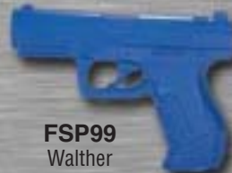
FSP99 Walther P99