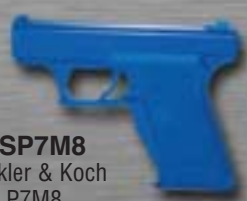
FSP7M8 Heckler & Koch P7M8