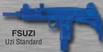
FSUZI Uzi Standard