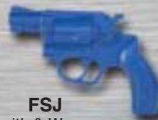
FSJ Smith & Wesson J Frame 2"