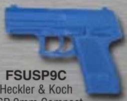
FSUSP9C Heckler & Koch USP 9mm Compact