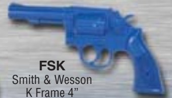
FSK Smith & Wesson K Frame 4"