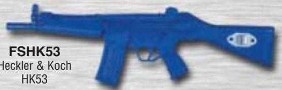
FSHK53 Heckler & Koch HK53