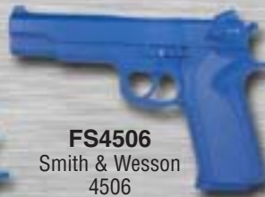
FS4506 Smith & Wesson 4506