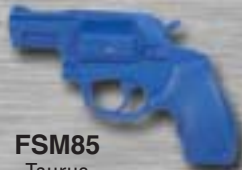
FSM85 Taurus M85