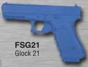
FSG21 Glock 21