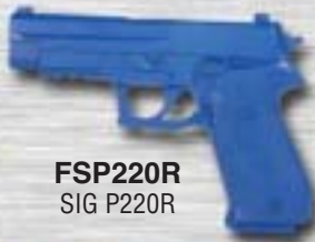
FSP220R SIG P220R