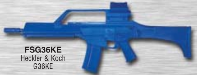
FSG36KE Heckler & Koch G36KE