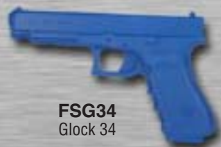
FSG34 Glock 34