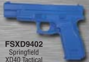
FSXD9402 Springfield XD40 Tactical