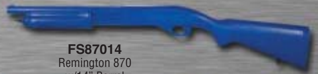
FS87014 Remington 870 w/14" Barrel