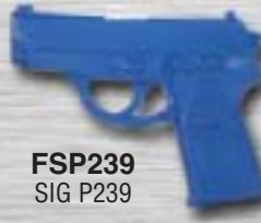
FSP239 SIG P239