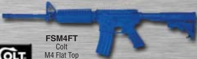
FSM4FT Colt M4 Flat Top