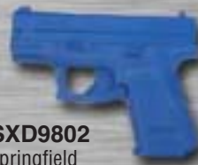
FSXD9802 Springfield XD40 Compact