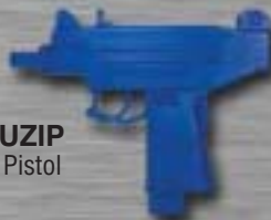
FSUZIP Uzi Pistol