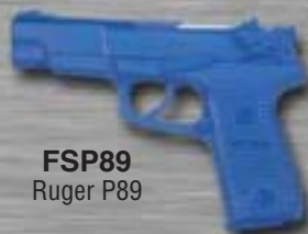
FSP89 Ruger P89