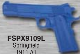
FSPX9109L Springfield 1911 A1