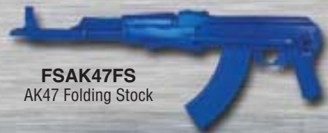
FSAK47FS AK47 Folding Stock

FN is the registered trademark of FN HERSTAL, Inc.