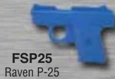
FSP25 Raven P-25