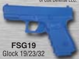
FSG19 Glock 19/23/32