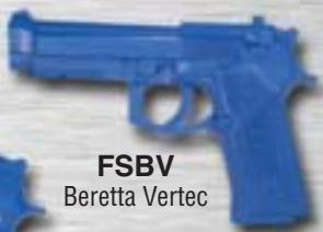
FSBV Beretta Vertec