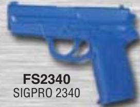
FS2340 SIGPRO 2340