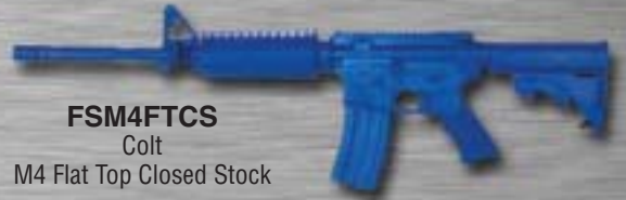
FSM4FTCS Colt M4 Flat Top Closed Stock