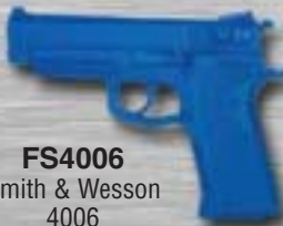
FS4006 Smith & Wesson 4006