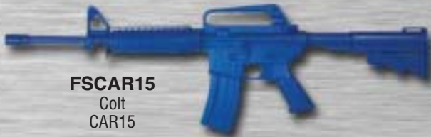
FSCAR15 Colt CAR15