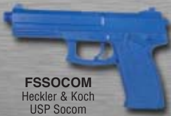
FSSOCOM Heckler & Koch USP Socom

Glock is the registered trademark of Glock Inc. USA