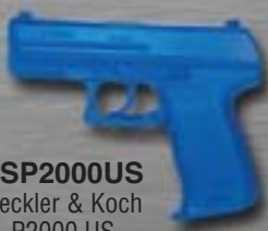
FSP2000US Heckler & Koch P2000 US