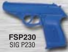
FSP230 SIG P230