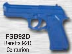
FSB92D Beretta 92D Centurion