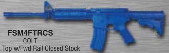
FSM4FTRCS COLT M4 Flat Top w/Fwd Rail Closed Stock