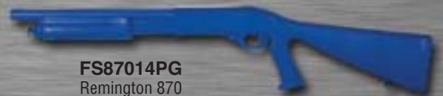
FS87014PG Remington 870 14" w/Pistol Grip