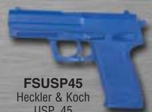
FSUSP45 Heckler & Koch USP .45