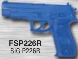
FSP226R SIG P226R