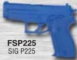
FSP225 SIG P225