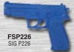
FSP226 SIG P226