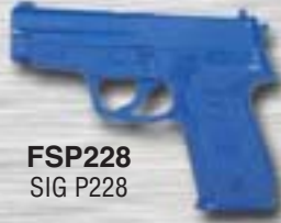
FSP228 SIG P228