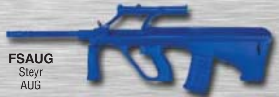
FSAUG Steyr AUG