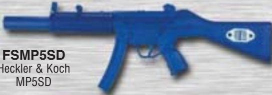
FSMP5SD Heckler & Koch MP5SD