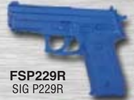
FSP229R SIG P229R