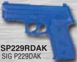
FSP229DAK SIG P229DAK