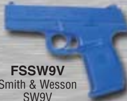
FSSW9V Smith & Wesson SW9V