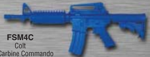
FSM4C Colt M4 Carbine Commando