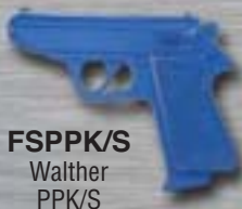
FSPPK/S Walther PPK/S

Taurus is the registered trademark of Taurus Internation MFG, Inc.