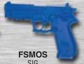
FSMOS SIG MOSQUITO 22LR