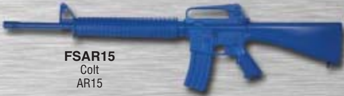
FSAR15 Colt AR15