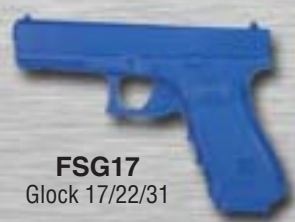
FSG17 Glock 17/22/31

Colt is the registered trademark of Colt Defense LLC.