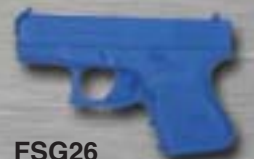
FSG26 Glock 26/27/33