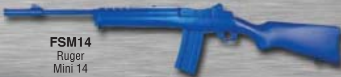
FSM14 Ruger Mini 14