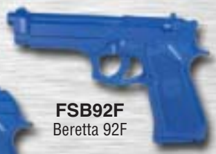
FSB92F Beretta 92F