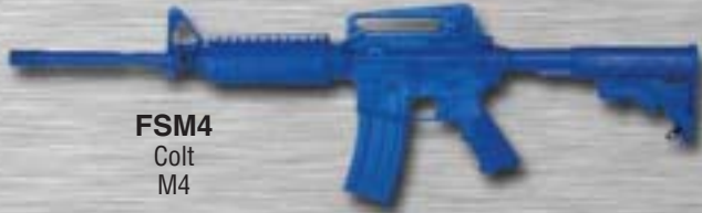
FSM4 Colt M4