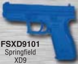
FSXD9101 Springfield XD9