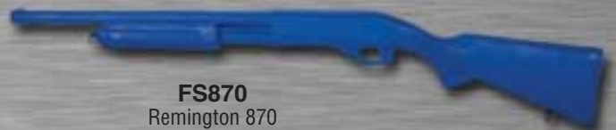
FS870 Remington 870

Benelli is the registered trademark of Benelli USA