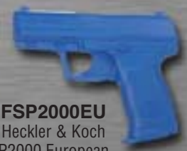
FSP2000EU Heckler & Koch P2000 European