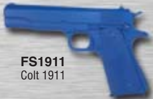
FS1911 Colt 1911