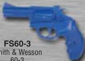
FS60-3 Smith & Wesson 60-3