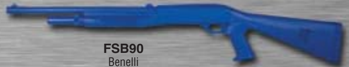
FSB90 Benelli Super 90

Colt is the registered trademark of Colt Defense LLC.