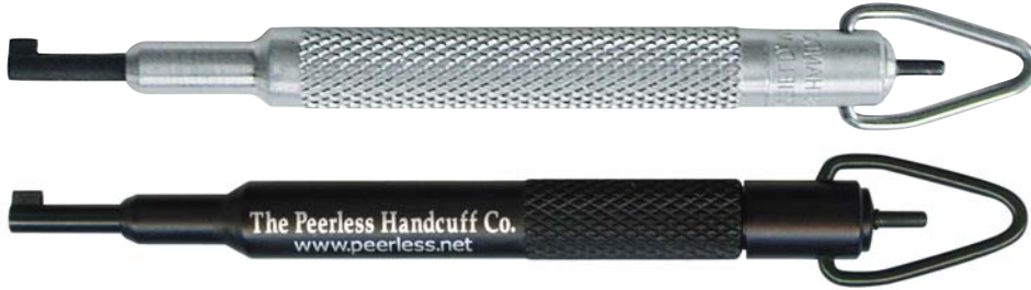
Oversize keys shown actual size.

A high quality extra large key designed to make double locking and unlocking restraints faster and easier. The extra long aluminum barrel is oversized and knurled for lighter weight and easy handling. The flag tip and double lock pin are made from heat-treated alloy steel for high strength and durability. Compatible with all standard type handcuff locking mechanisms. Available in silver and black finish. Comes with a key ring and lifetime warranty for manufacture defects.