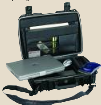
iM2370 Lid organizers feature deep expandable folder pockets plus several smaller pockets for attaché-style storage and access.