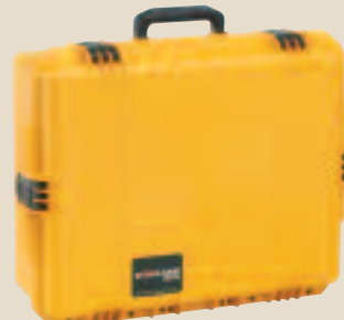
iM2700 Molded-in stacking ribs provide no-slip stability for multiple case stacking during storage or transport.