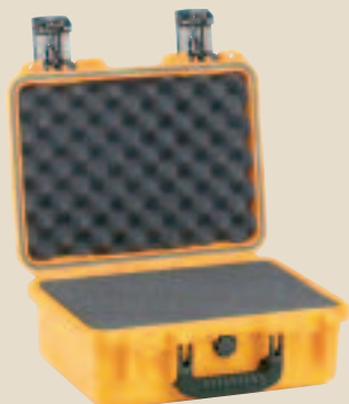
iM2100 The option of easy-to-customize, multilayer cubed foam to secure your specific gear is available with most cases.