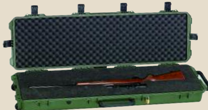
iM3300 Press & Pull latches hold fast under duress, yet make every Storm a cinch to open smoothly without snapping back on your fingers.