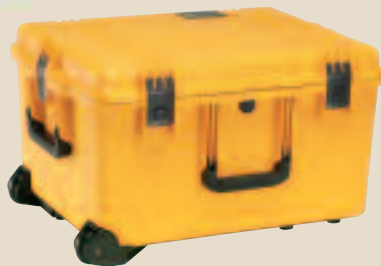
iM2750 Multiple handles provide additional transport options for larger and heavier packed Storm Cases.