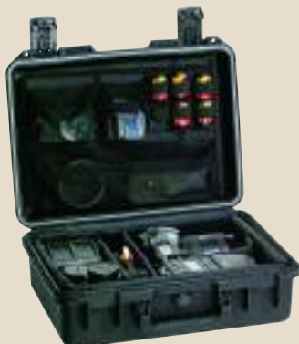
iM2400 Optional padded dividers separate and protect even the smallest, most delicate equipment.