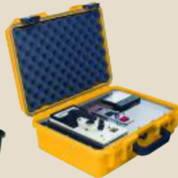
iM2400 Add a bezel kit and you can transport ultra-sensitive panel mounted equipment with ultra-confidence.