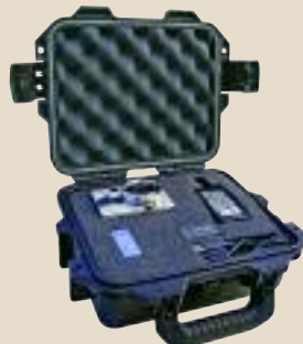
iM2050 Small to large sizes suit every equipment need with the same tough features.