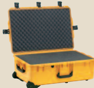
iM2950 Along with additional handles, multiple latches on larger Storm Cases ensure maximum security and durability.