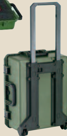
iM2720 Storm Case's Storm Trak® series boasts uniquely rugged, yet lightweight, telescoping handles that lock in place plus rugged in-line wheels for ease of transport (available in a wide range of sizes).