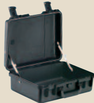
iM2200 The addition of optional lid stays will hold your Storm Case securely open for easier access.