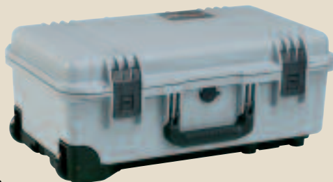
iM2500 A large selection of Storm Cases meet airline carry-on regulations by fitting under seats and in overhead compartments.