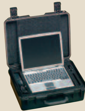
iM2300 The option of custom-cut foam ensures that your specific gear is completely secure.