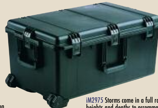
iM2975 Storms come in a full range of heights and depths to accommodate various or bulky-sized equipment.