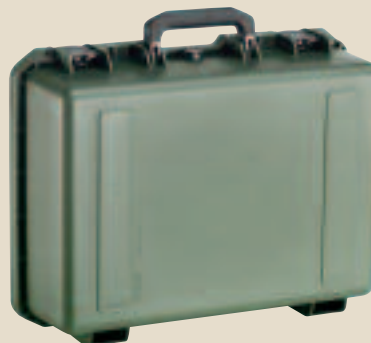
iM2600 The unique hinges with feet on every Storm Case hold fast under impact and are specifically designed to create a flat surface for upright stability.